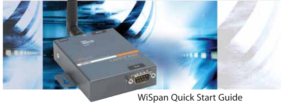
WiSpan Quick Start Guide